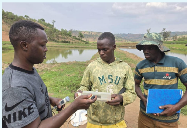
A RARICO aquaculture technician providing on the job training to a fish farmer in Ngoma District